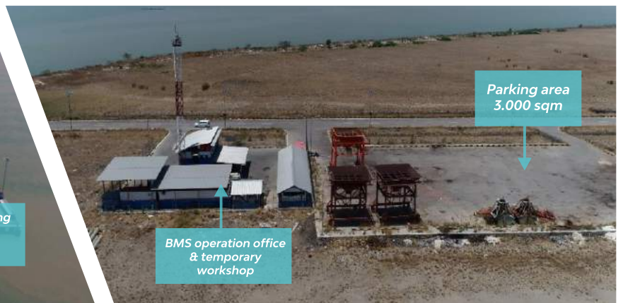
Extension of Multipurpose Jetty 250m x 50m in progress