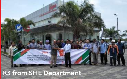
K3 from SHE Department

10 January 2019, a socialization program of "Zero Tolerance For Accident" has been conducted for all tenants and contractors in JIPE Industrial Estate to ensure work safety