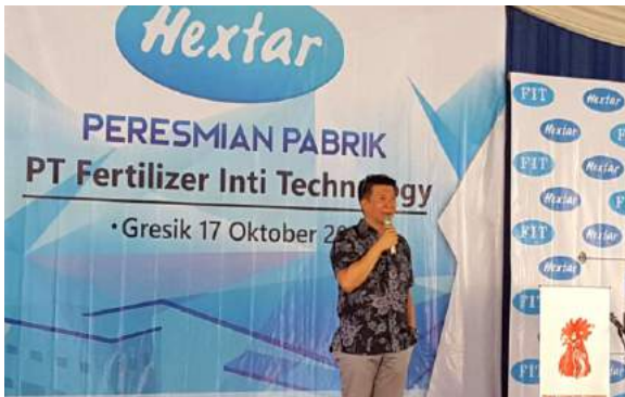
Inauguration Ceremony on 17 October 2018