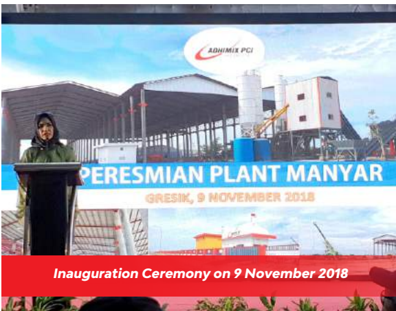
Inauguration Ceremony on 9 November 2018

PT Fertilizer Inti Technology (FIT) was established in 2018, which is engaged in the distribution & manufacture of NPK based fertilizer Controlled Released Fertilizer (CRF) SIMPLOT from USA for plantation market and fertilizer technology compaction for retail market (NPK COMPACTION DGW). It also markets high tech fertilizers of NPK Blend + Nutrisphere + Avail as well as micro compound fertilizer type Chelated Lignosulfonate (COPPERZINC) from Brazil.